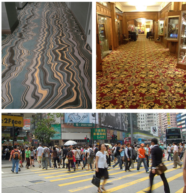
Figure 1 Complex visual stimulation such as patterned carpets (above) or busy streets (below). Above images are from the personal archive of Jeffrey P Staab. Photo below is Busy Street in Causeway Bay by edwin.11, licensed under the Creative Commons Attribution 2.0 Generic licence, cropped.

disorder that has been recognised by the WHO and will be included in the upcoming 11th edition of the International Classification of Diseases 6 and the recently established International Classification of Vestibular Disorders. 7 The new name, PPPD (best pronounced ‘triple PD’ or ‘three PD’ to avoid confusion with BPPV (benign paroxysmal positional vertigo)), aims to provide an aetiologically neutral but positive diagnostic term that avoids jumping to conclusions about whether the symptoms have arisen from a structural lesion or a purely ‘phobic’ or ‘psychogenic’ process.