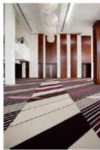
Patterned carpets or places with a lot of sensory stimulation can make dizziness in PPPD worse

Typically, the disorder follows occurrences of acute or episodic vestibular or balance-related problems. Symptoms may begin intermittently, and then consolidate."